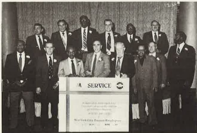
Some happy Anniversary celebrants at the first ceremony on November 21, 1987.